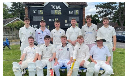
Old Borlasians XI