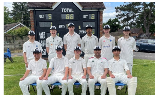
Borlase 1st team XI