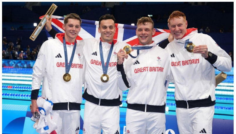
From L-R Duncan Scott, James Guy, Matthew Richards and Tom

The quartet have dominated the event in recent years, winning gold at both the rescheduled Tokyo Games in 2021 and at the 2023 World Championships in Japan.